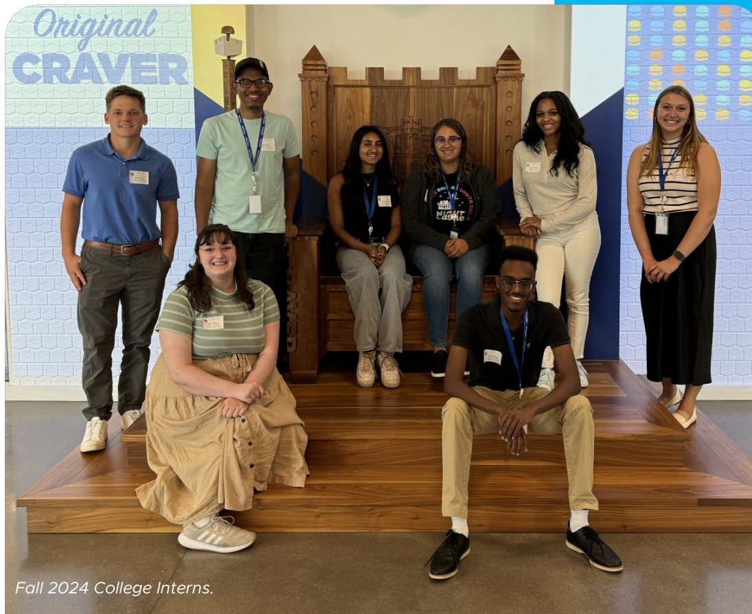
Fall 2024 College Interns.

With four-generations of family leadership, the G5 Internship was designed with the intention of providing our next generation of family members valuable life lessons and exposure to business opportunities, while engaging them with the company their ancestors helped build. Since its inception in 2021, 12 fifth-generation family members have participated in the 8-week long program, interning each summer for the past one to four years.