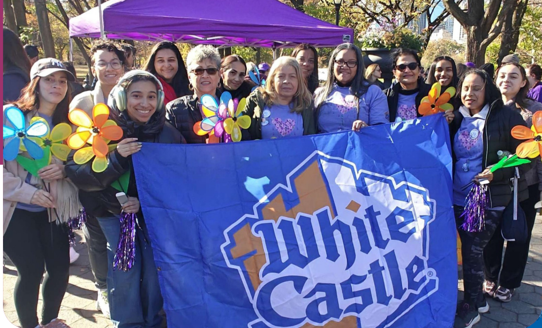
New York City Restaurant Operations at Walk to End Alzheimer's.

2024 Great Place to Work® Trust Index Survey™